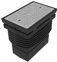
*PIT NOT INCLUDED